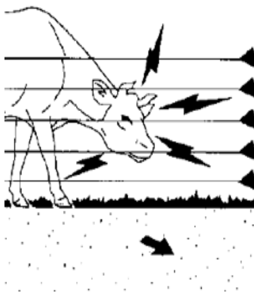
Fig 2.1- Demonstration of electricwire fencing

To protect the field from the animals entering the field, people use a method of electrical fencing, which may lead the death of the animals and as well as the humans coming in contact with the electrical fence. At the time of power cut, the electrical fencing system fails in terms of protection of crop.